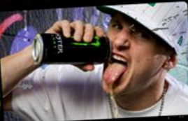
ROB DYREK SKATEBOARD STREET