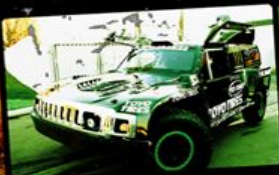
ROBBY GORDON OFF-ROAD