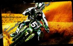
RYAN VILLOPOTO MOTOCROSS