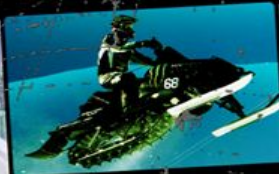
TUCKER HIBBERT SNOCROSS