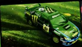
KEN BLOCK RALLY-RACING